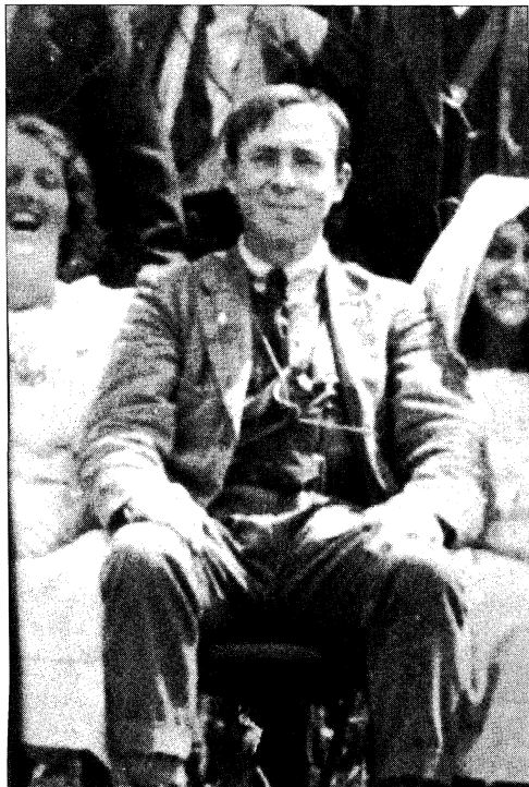
Above: A group of Flying Column members ready to set out. Nobody in this picture is now identifiable.