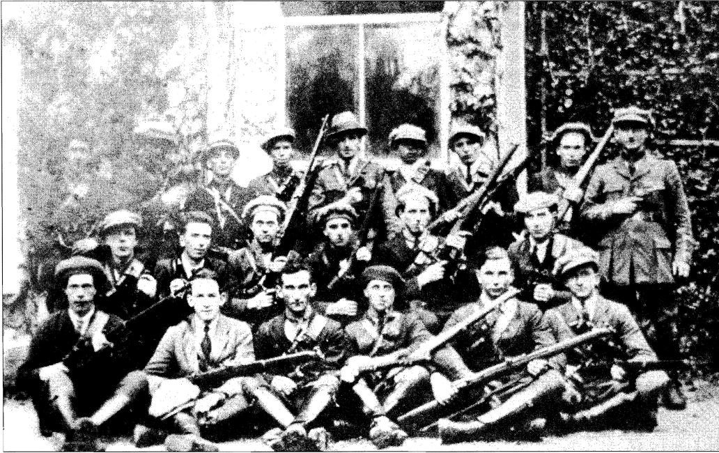
Top: another unidentified Flying Column 'snapped' as they set off for action.